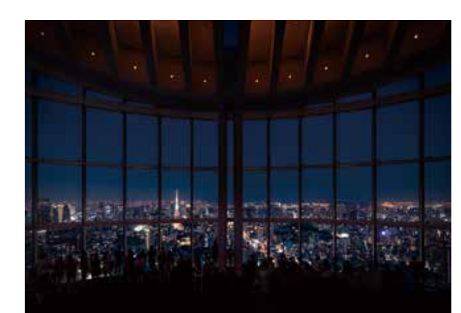
Roppongi Hills Tokyo City View

The town of Roppongi is filled with popular nightspots with visitors from abroad. There are many international shops and restaurants, so it should be easy to find something to suit your taste. This area is now developing into an artistic and cultural center with two major entertainment complexes. Roppongi Hills houses a cinema complex, restaurants, and the Mori Art Museum and on the 52nd floor is "Tokyo City View" where a 11m height of glass-walled observatory offers stunning views of the city. Tokyo Midtown includes the Suntory museum of Arts,21_21 DESIGN SIGHT as well as international restaurants and boutiques.