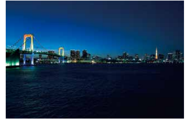
Rainbow Bridge in Odaiba

Other places of interest include Odaiba Kaihin Park, Miraikan (National Museum of Emerging Science and Innovation), Museum of Maritime Science, Telecom Center Obsevatory, Fuji Television, Tokyo Big Sight (exhibition hall) and Panasonic Center. Oedo-Onsen Monogatari is a hot springs theme park where you can enjoy a variety of hot springs as well as the traditional lifestyle and culture of the earlier Edo Period.